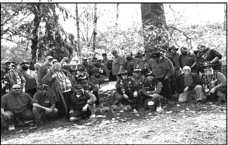
E Clampus Vitus, Doc Maynard Chapter around the plaque