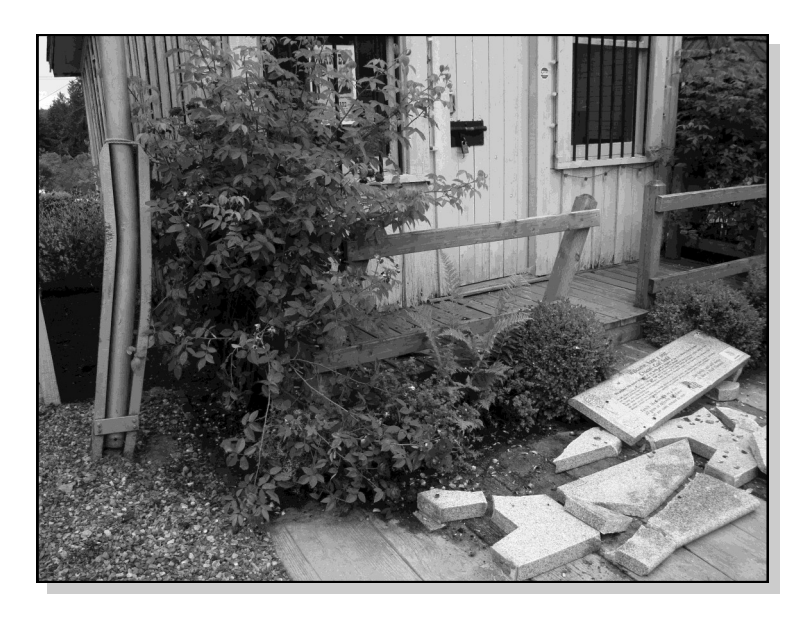
Damage to the granite benches, flag pole and jail from an early morning auto accident.

Bringing Santa to town in September, a Labor Day parade attraction holds its appeal this weekend as a dinner fundraiser for Black Diamond's "Hometown Christmas," a December event. ~By D'Ann Tedford, Voice of