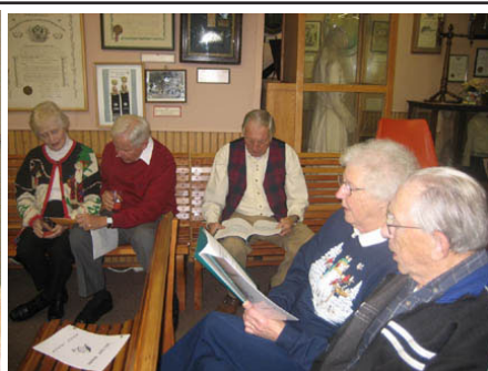
Carolers Page 6