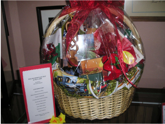
Left: 2nd prize goody basket